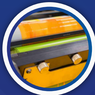
Flexible Packaging Printing